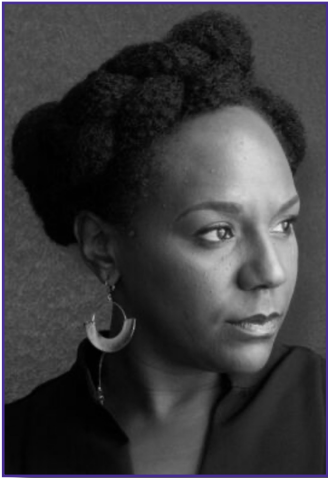
BREE NEWSOME BASS

AWARD-WINNING ARTIST AND HUMAN RIGHTS ACTIVIST