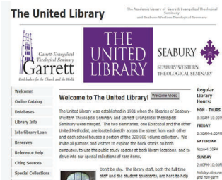
Screen Shot of New Web Page Design.