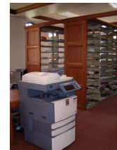
New copiers have arrived!

Old copy cards, if you have them, may be used until the vendor removes the old machines or until the 15 of Sept. We no longer sell the old cards. We will also accept cash payment during the transition. Thanks!